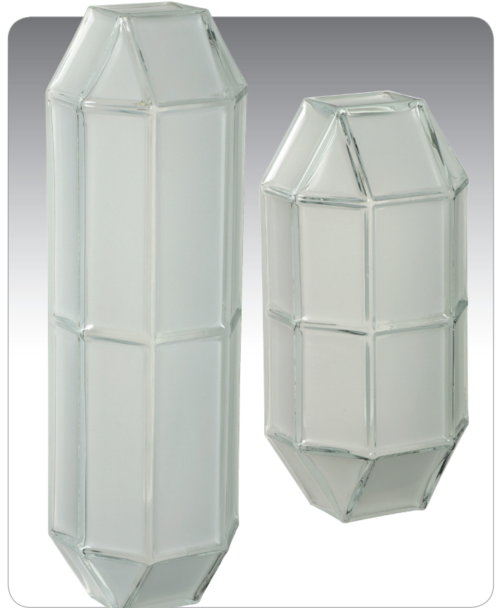
PRISMO 16 & PRISMO 10 SHOWN IN FROST/CLEAR

UL or ETL Listed. Suitable for Wet Locations (interior or exterior use).